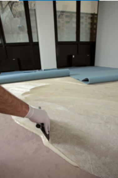
Applying Ultrabond Eco 170