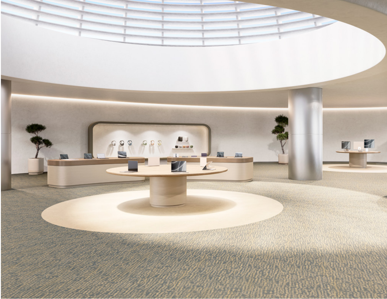
RAY 528, OPULENT 150